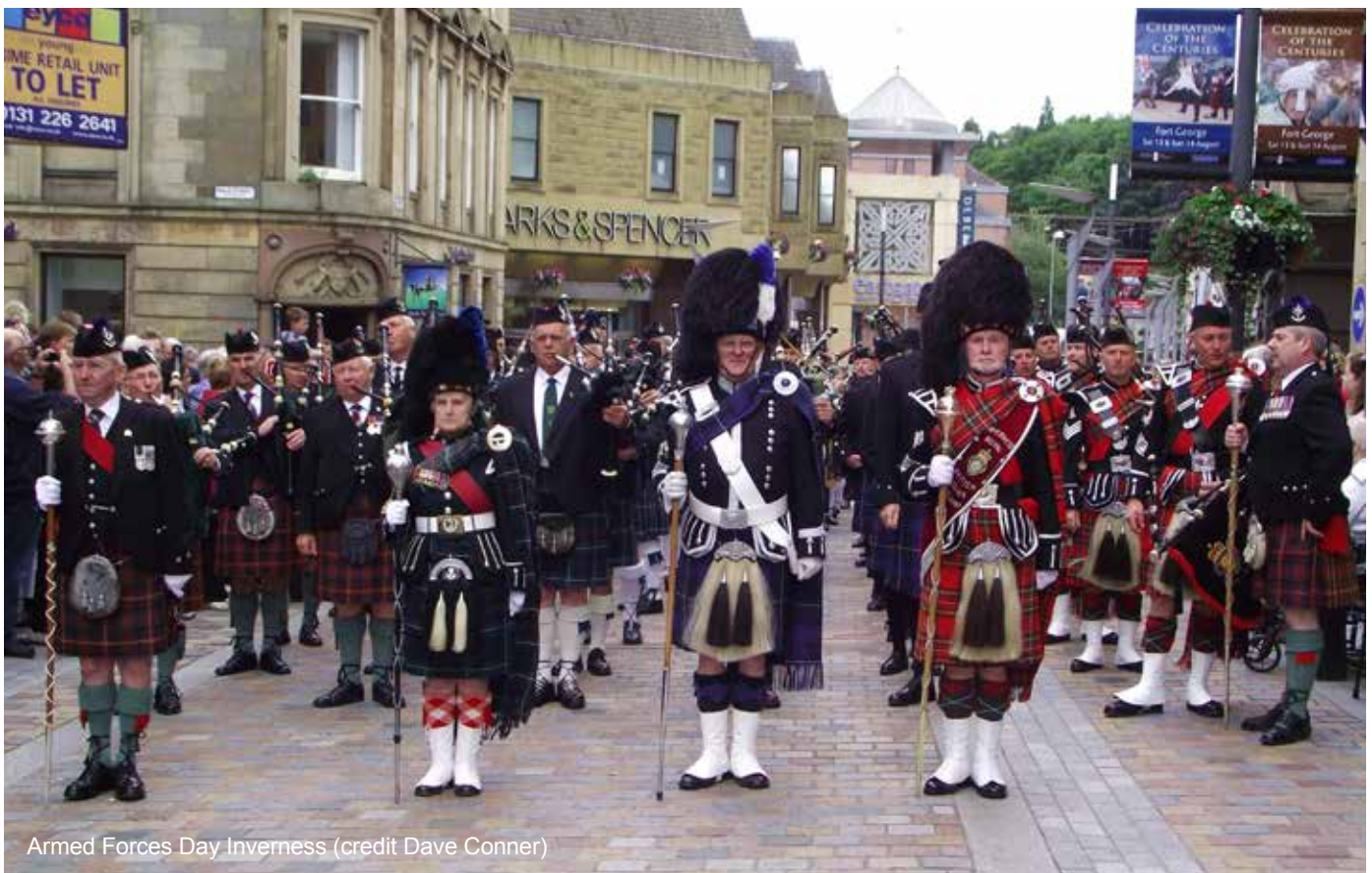
Armed Forces Day Inverness