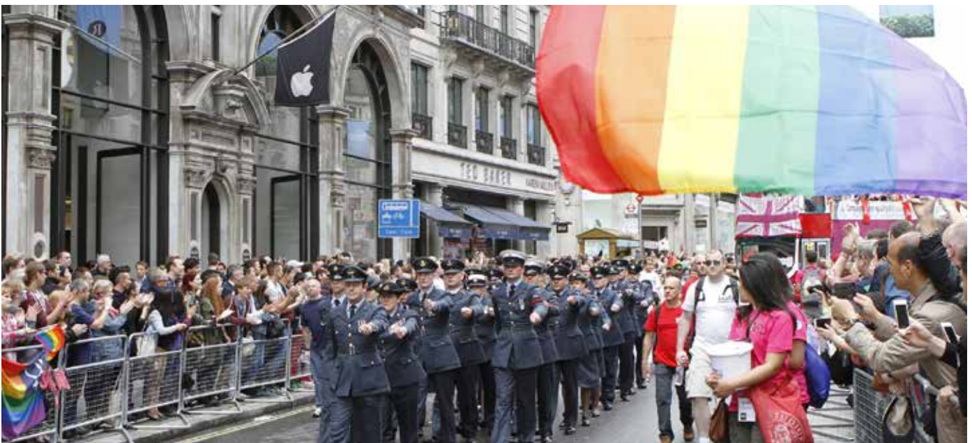
RAF London Pride

You can find out about the campaign for fair treatment of LGBT+ veterans affected by the ban, and support available for them, online at www.fightingwithpride.org.uk