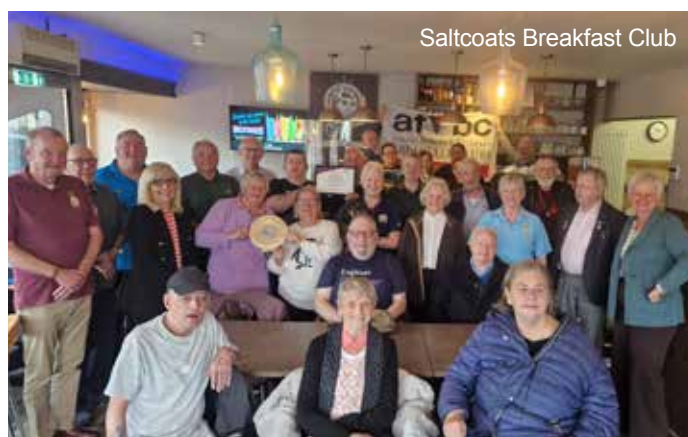
Saltcoats Breakfast Club