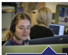
Providing information, advice and friendship – including our free confidential national helpline, information guides and friendship line.