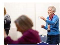
Delivering health and wellbeing programmes