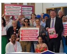
Campaigning and influencing