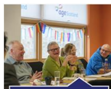
Supporting and enabling older people's community groups