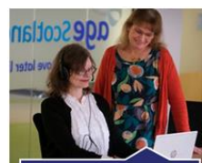
Promoting age friendly workplaces and communities